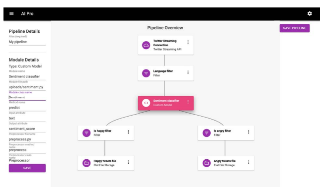
Figure 1: Screenshot of AI Pro.

The world is noticing an adoption of AI from many companies now and we believe them to have aggressive plans for the future [3]. These companies are actively looking for process automation, cognitive insights, and trend and time series predictions for optimizing their businesses & services. AI frameworks like Tensorflow, Torch (PyTorch), Caffe, and Keras are empowering data scientists to build complex AI models, solving a wide range of problems in the aforementioned fields. Researchers and collaborators have trained and made publicly available many models in computer vision, natural language processing, neural machine translation, and speech recognition. These models are ready to make predictions on arbitrary input data. However, putting these models into practice requires coding expertise to deploy and execute. Creating data pipelines with any such AI model is not